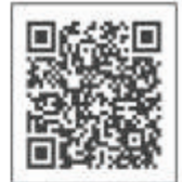
LEARN ABOUT THE AUTHORS OF OUR PARISH COMMUNITY

The community/communion of the triune God—Father, Son, and Holy Spirit—is the perfect witness to the truth that mystery creates. One God, three divine persons. The Eucharist that we celebrate on this day proclaims the unity of our belief—to the Father, through the Son, by the power of the Holy Spirit. ●